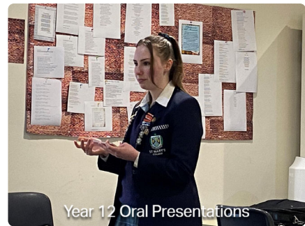
Year 12 Oral Presentations