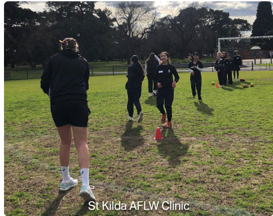
St Kilda AFLW Clinic