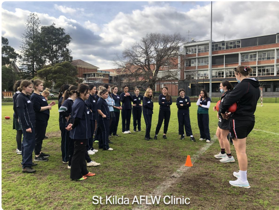
St Kilda AFLW Clinic