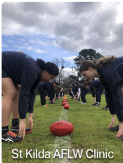
St Kilda AFLW Clinic