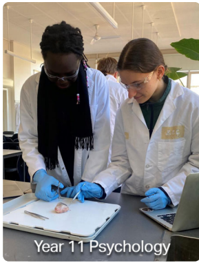
Year 11 Psychology