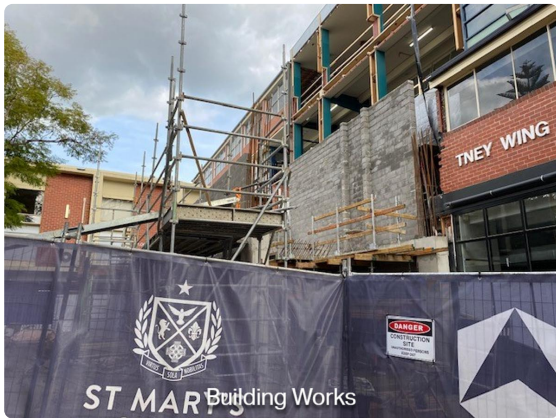
ST MARY'S Building Works