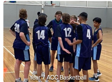
Year 7 ACC Basketball