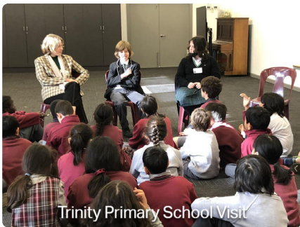
Trinity Primary School Visit