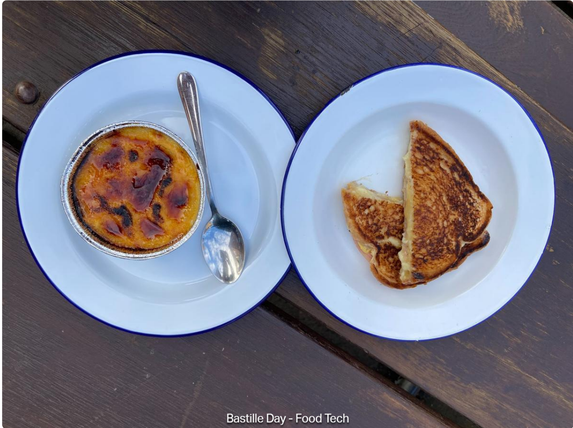
Bastille Day - Food Tech