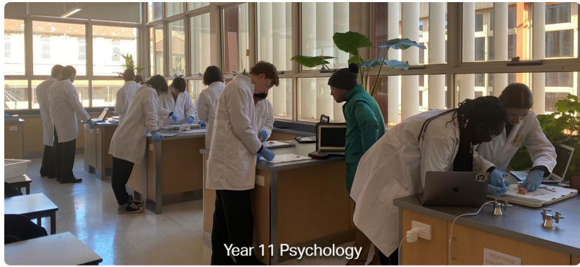
Year 11 Psychology