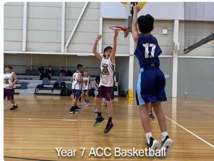
Year 7 ACC Basketball