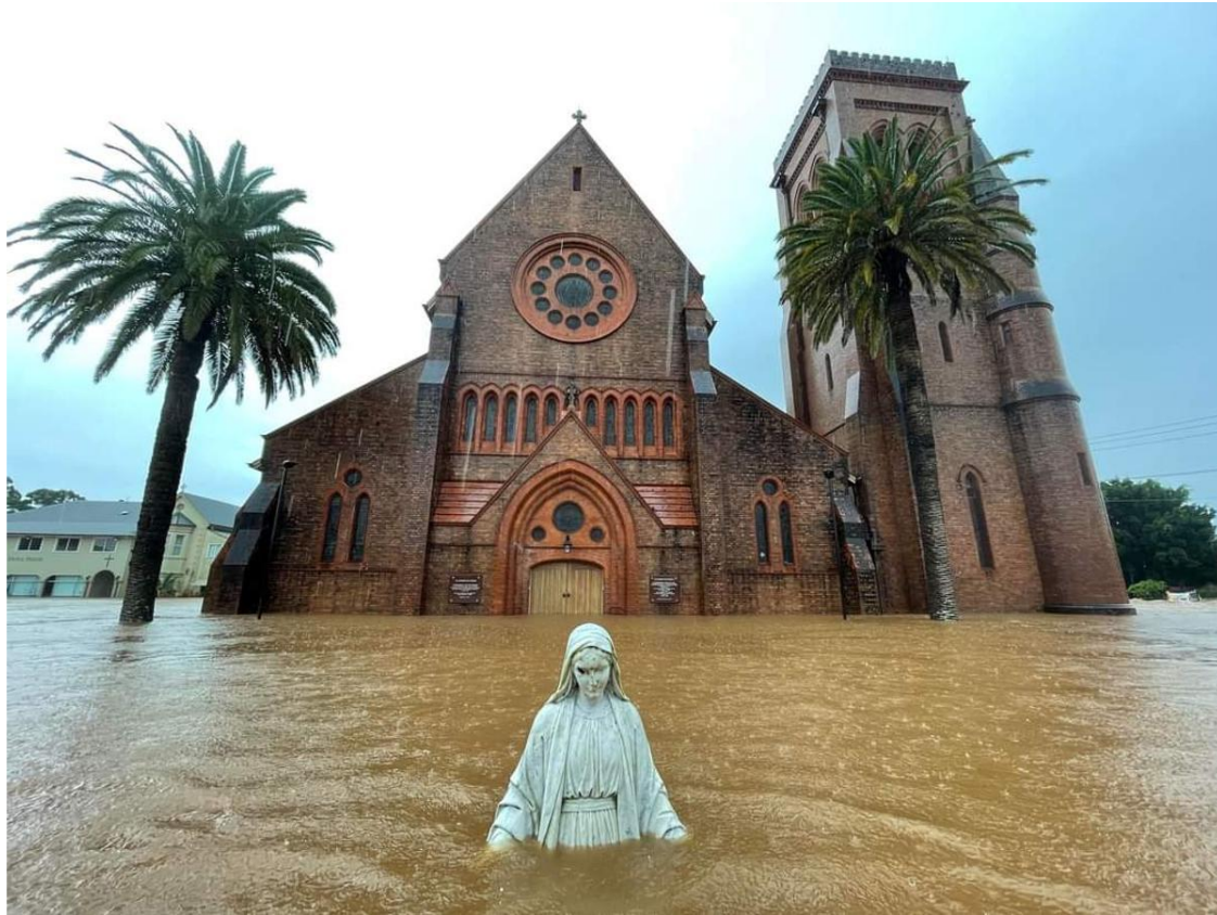
Trinity Catholic College, Lismore NSW

The school has been submerged by the floods and consequently badly damaged. All students are now having lessons online with some senior students having been relocated to another place. As a community we can only imagine the distress such an event causes and I would encourage everyone to take a moment to think of and pray for the community of Trinity Catholic College.