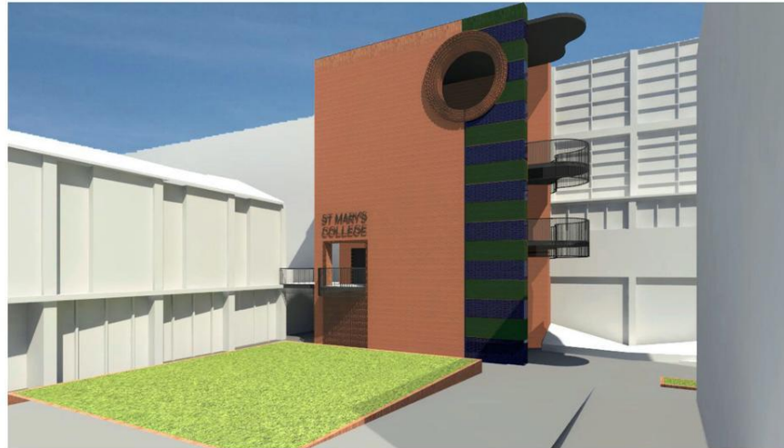
ST MARY'S COLLEGE STAGE 1 MODERNISATION WORKS TO MCCARTNEY WING + CORBETT WING

Pictured below is an impression of the proposed new Lift and Stair.