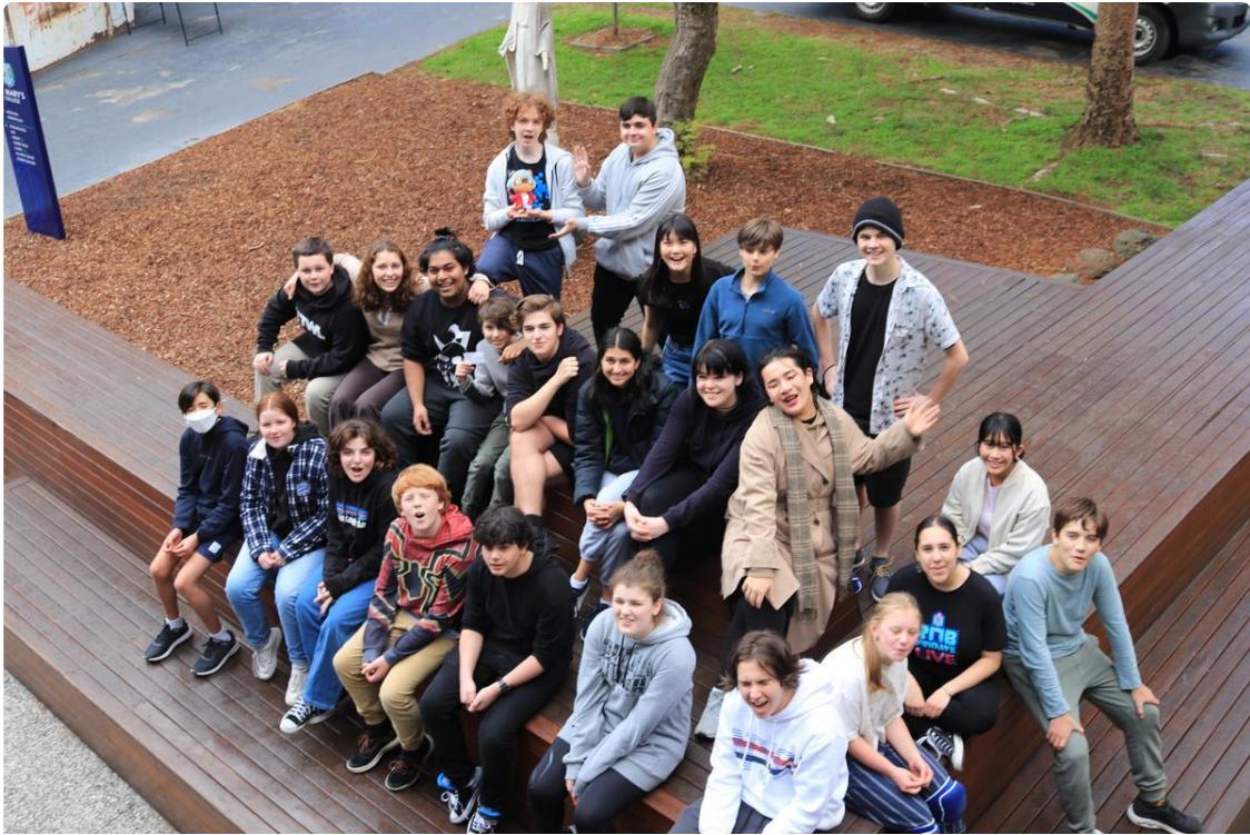
Charlie and the Chocolate Factory Crew